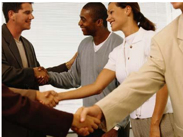
Networking In Action

Moreno Valley Black Chamber of Commerce PO Box 632 Moreno Valley, CA 92556 951/443-0226